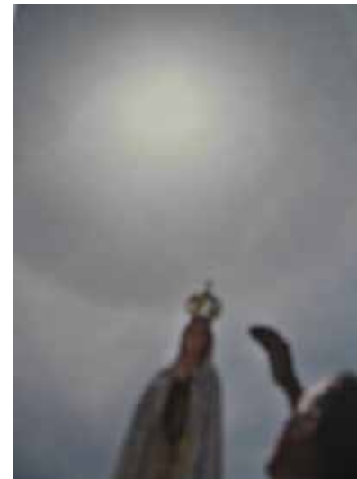
THE DANCING SUN PHOTOGRAPHED DURING THE 2012 PILGRIMAGE