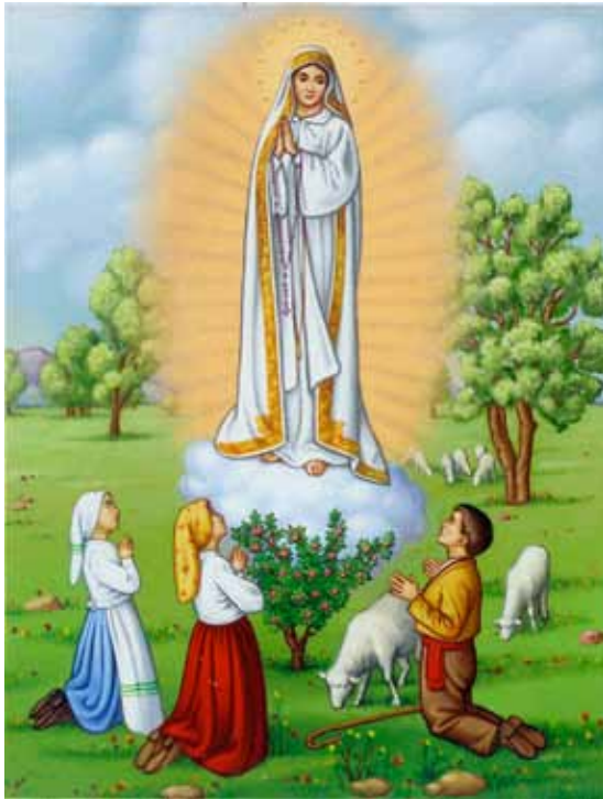
An Icon of Our Lady of Fatima